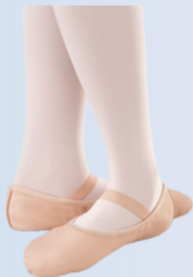
Pink Leather Ballet Shoes