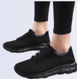
Black Tennis Shoes