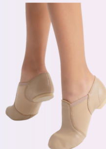
Tan Leather Jazz Shoes