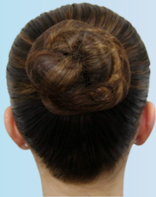
Hair in a bun